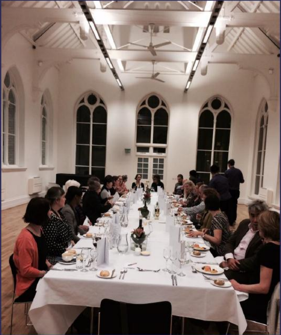
The Centre for Legal Education Conference Dinners 2014